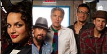
Norah Jones / The Little Willies