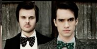
Panic! At The Disco