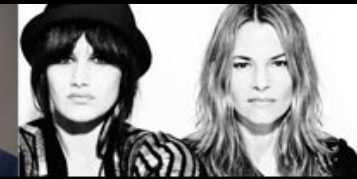
Uh Huh Her